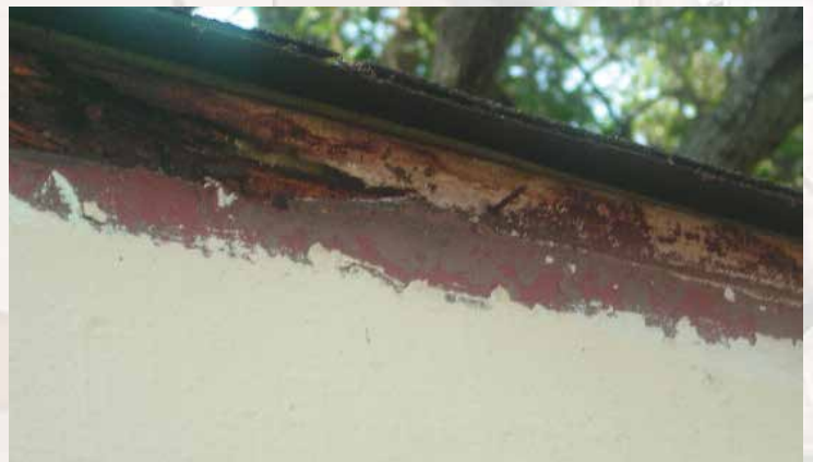
Conventional Gutters Trap Moisture Behind the Gutter and are Prone to Harmful Mold, Fungus and Rot