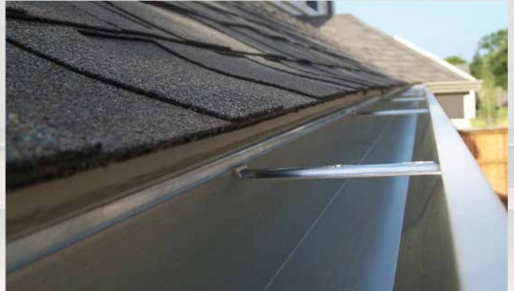
The SnapLock™ Gutter System Floats Freely Along the Patented Truss Ensuring Structural Integrity and Proper Ventilation