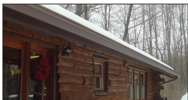
After Activated Heated Helmet