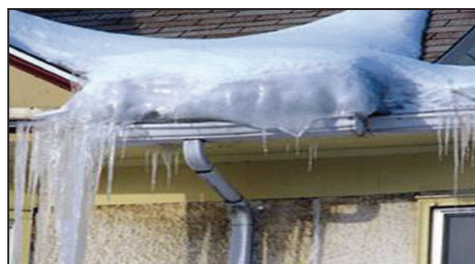
Ice Dams can cause damage inside and outside your home

$100 OFF any project of the above with minimum $1000 PURCHASE