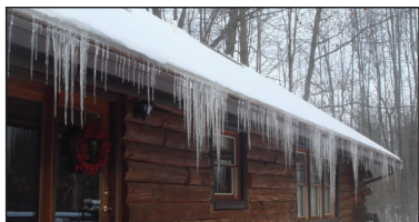
Before Activated Heated Helmet